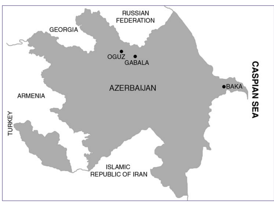
A map of Azerbaijan. The pipeline will run from fresh water wells in Oguz to the capital city Baku.

Installation is a major challenge for a massive pipeline which passes through many types of terrains and crosses rivers, motorways and railways. The significantly lighter weight of GRP, as compared to steel, facilitates installation, reduces the size of the