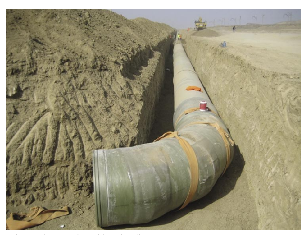
Each section of pipe is 12 m long and the pipeline will require 25 000 joints.

Azkompozit's achievements might lead to the conclusion it is relatively easy to start a large diameter GRP pipe company from scratch and take on such an enormous project. In fact, the start-up challenges were daunting.